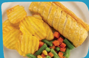
Ham carbonara with pasta

CHOOSE FROM Vegetarian sausage roll with crinkle cut wedges V