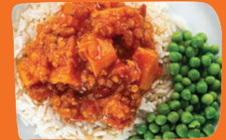
Fish fingers and chips

CHOOSE FROM Sweet potato and lentil curry and rice