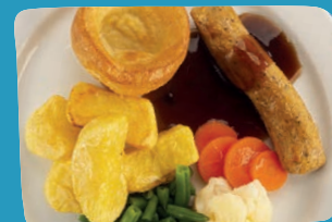
Sliced beef and Yorkshire pudding

CHOOSE FROM Plant-based sausage and Yorkshire pudding V