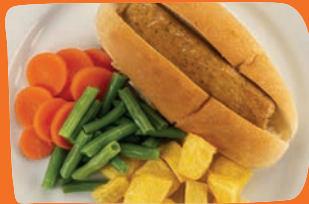
Chicken curry and rice

CHOOSE FROM Plant-based sausage hotdog and diced potatoes