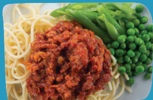
Chicken Katsu curry and rice