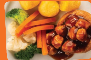
Sliced chicken and Yorkshire pudding

CHOOSE FROM Quorn pieces in a Yorkshire pudding